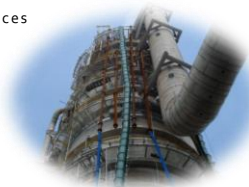
Petrochemical & Environmental Engineering Services