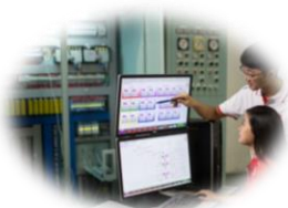
System Integration, Maintenance, Repair, Overhaul & Trading