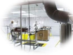
Cleanroom, Air & Water Solutions

A leading player in System Integration, MRO, Precision Engineering, Scaffolding, Insulation, Coating, Cleanroom, Air & Water, Petrochemical & Environmental Engineering Solutions.