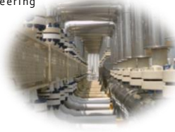
Insulation & Coating Services